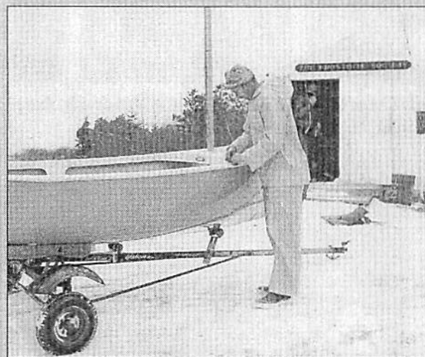
An unidentified Frostbiter preps his craft for sail. Behind him is the Frostbite headquarters, a battery shack behind Bayside Marine.

PART VI The Real Dig: Duxbury Shellfishing